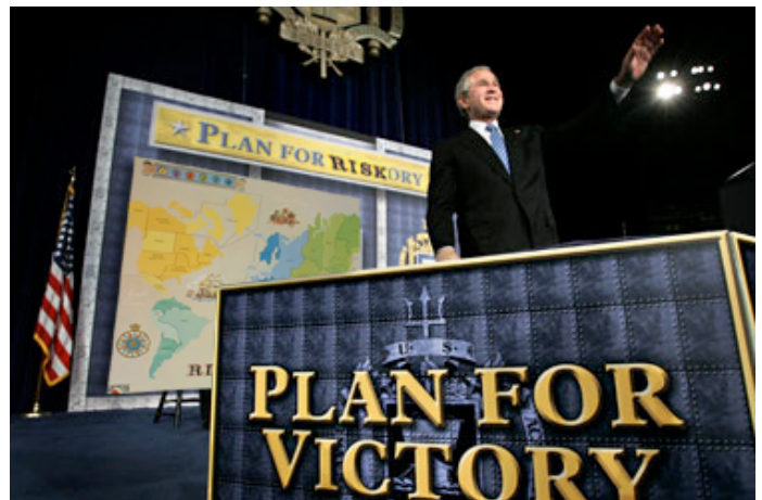
After fortifying the Middle East, Bush plans to take a snack and crap break

"This surge will never succeed," said Muqtada al-Sadr, a key figure in the Iraqi insurgency, in a rare interview. "Death to America!" he shouted as he drew a +5 card, putting his piece in the same space as one of the American pieces on the board. He looked up. "Sorry."