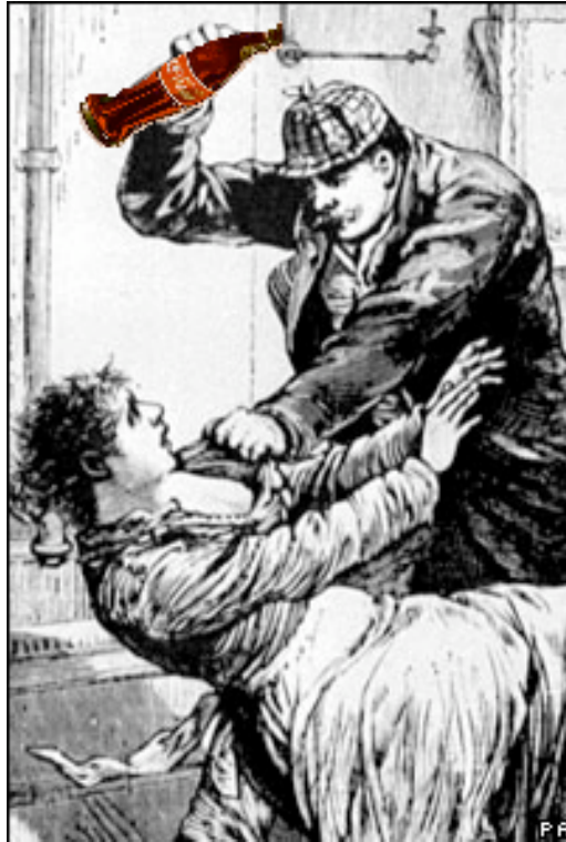
Killer Coke is known to have a penchant for fecund quenches

Killer Coke is known for the increasingly grisly ways in which he carried out his murders. His first six victims were discovered with sliced throats, but as he became more adventurous, he turned to blunt objects, rarely stopping until he had Crushed the skulls flat. "Oh, he's got some Moxie, all right. Bawlsy as Satan on a bender, if you ask me, and twice as Blak-hearted," said Detective Jones of the Pibbsburg police. "But the Pepsirial rapist? He's just some Mugger that got to fond of