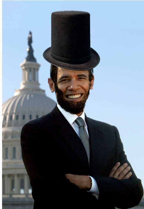
Senator Roosevelt showcasing his new image before his 2 week campaign tour of the border states and Gettysburg

Candidates from both sides of the aisle are feeling the Obamania. Longtime Arizona Senator and Republican presidential frontrunner John McObama said in a nationally televised speech, "The time has come for me to show that I am serious