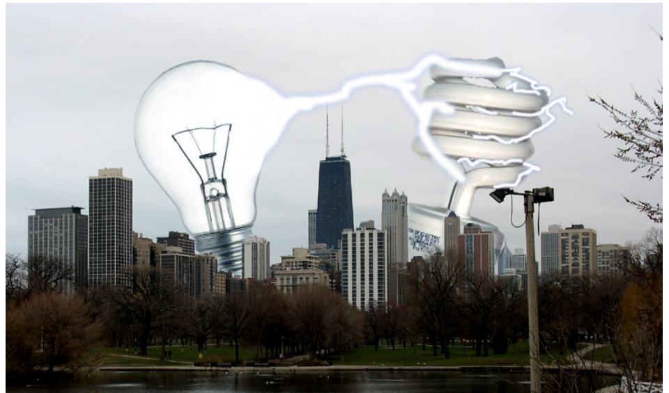
Students missed the awesomeness of fluorescence and incandescence in their greatest battle to date due to midterms