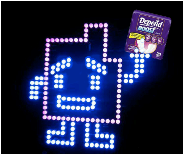
The Boston City Council recommends that the ads be changed to have a more senior-friendly feel